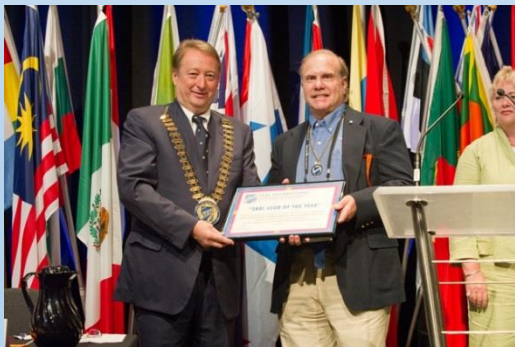
2010 – 2 nd Place