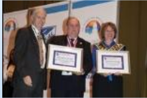
2015 – 3 rd Place