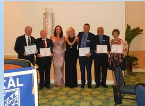
15 - 34 Years Members