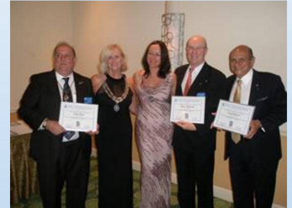
35 Years or longer Members