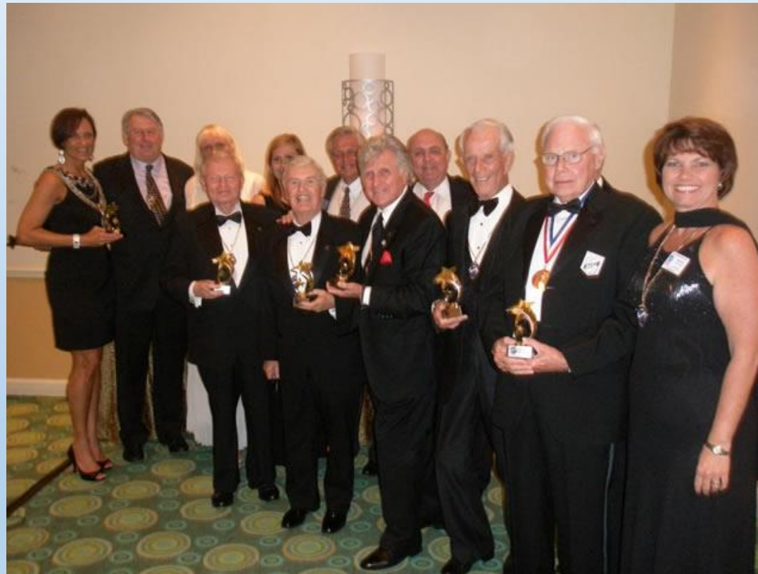
35th Anniversary – Past Presidents Honored